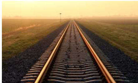
ProRail (rail monitoring movement)