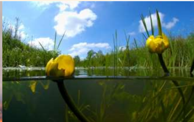
Water board (dike monitoring)