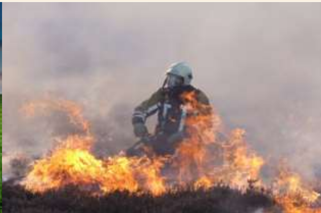
Fire Department (Vegetation)