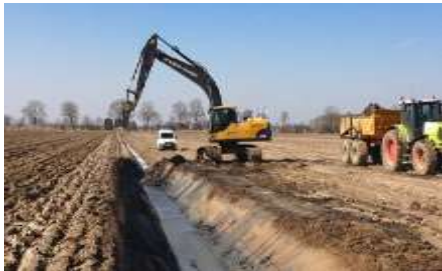
Police (soil criminality)