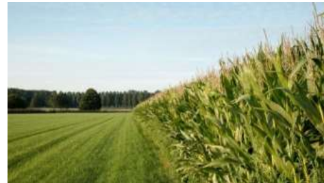
RVO & CBS (Nature & Agriculture)