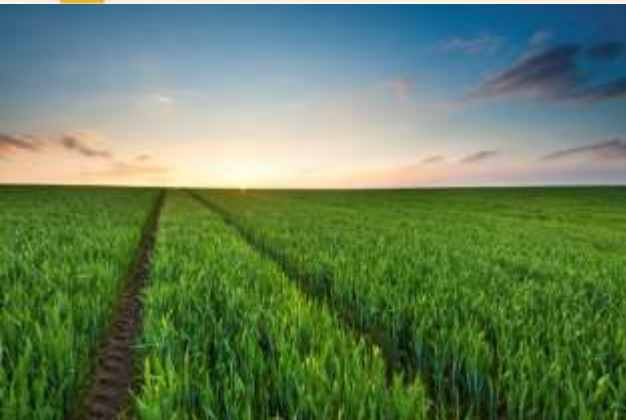
NVWA (surveillance & enforcement agricultural)