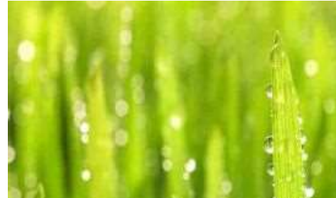
Water Boards (evaporation)