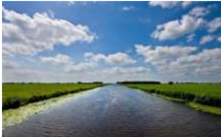
RWS (Water quality)