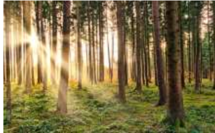
SBB (nature “mapping”)