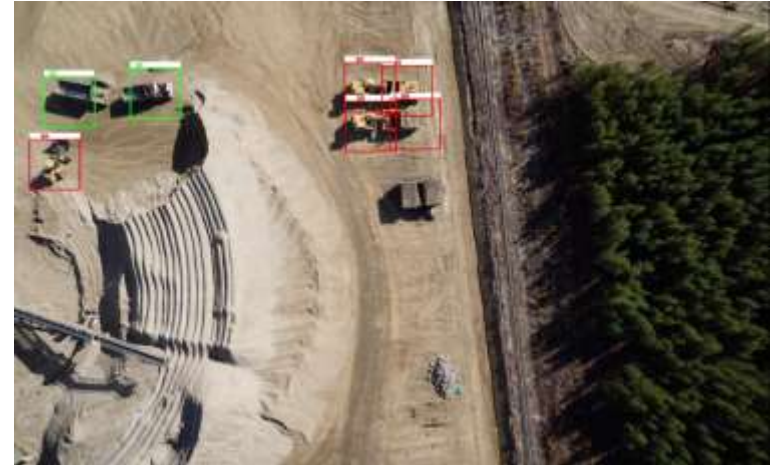
Kespry & NVIDIA