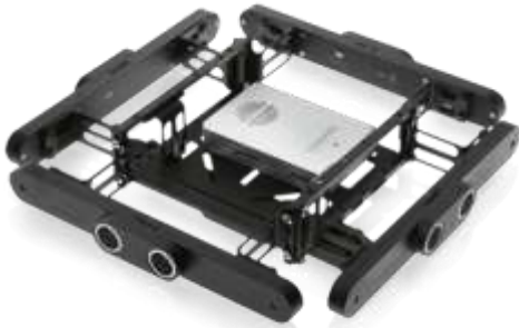
DJI Guidance System