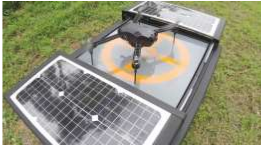
H3 Dynamics Drone Box