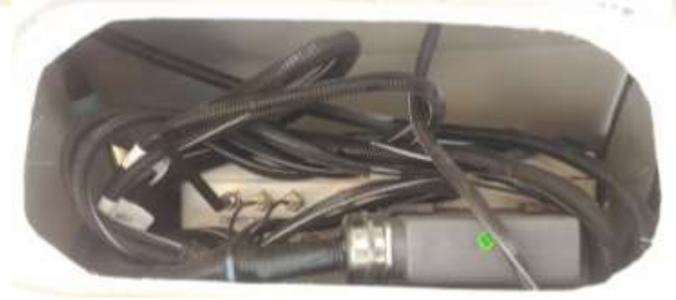
Single Control Unit (SCU)