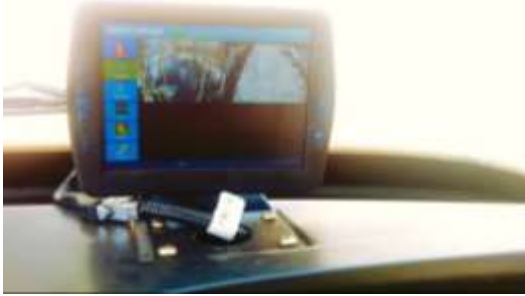
Bus Driver Console (BDC)