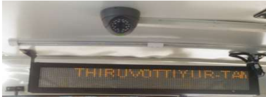
Security Network and Camera PIS Display